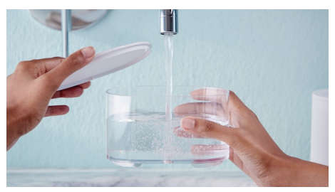
The 550ml resevoir holds enough water for one cleaning. To refill simply lift out, fill and click back in.