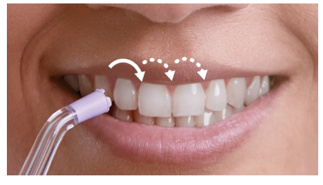
Gentle pulses of water guide you from tooth-totooth so that you don't miss a spot.